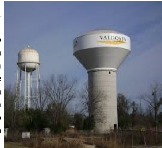
Man learnt to store Water

I was intrigued when the change of a question brought about radical changes in the growth of civilization. Nomads, in history, asked the question: how do we get to water?" Hence they moved towards water sources. As a result cities, towns, and habitations developed near sea ports, river banks, and around lakes. When we changed the question into: 'How do we get the water to come to us?' a new thinking took place. There was a radical paradigm shift. Irrigation, wells, storage of water, bringing water to our inhabitations became the order of the day. Civilization process took a new turn. Questions drove new results!